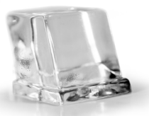
NW 508 Full Cube 12 g W 26,5 x D 26,5 x H 26 mm