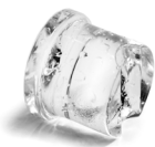
MXG L 328 Large Gourmet 39 g Ø 38 x H 41 mm